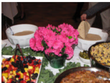
The food was DELICIOUS!

items are always a hit with all as well. A big THANK YOU to all generous donors of baskets, items, and monetary donations!!!!