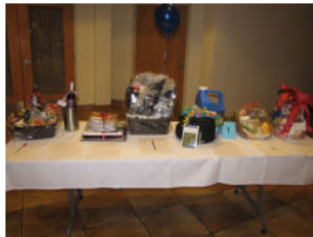
One of the many silent auction tables

Mark your calendars or put it on your phone-next year's Gala is SATURDAY, April 9, 2011 - same place. It will be the last major fundraiser before the village beginning in June and members and friends support will be extremely necessary!!!! Thank you in advance for your support!